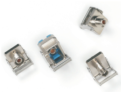
Optical adapters (BN 2150) for laser source output